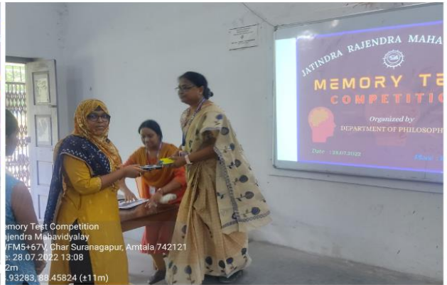
Project: Memory Test Competition Jatindra Rajendra Mahavidyalaya Address: WFM5+67V, Char Suranagapur, Amtala 742121 Date & time: 28.07.2022 13:08 Altitude: -12m GPS: 23.93283, 88.45824 (±11m)