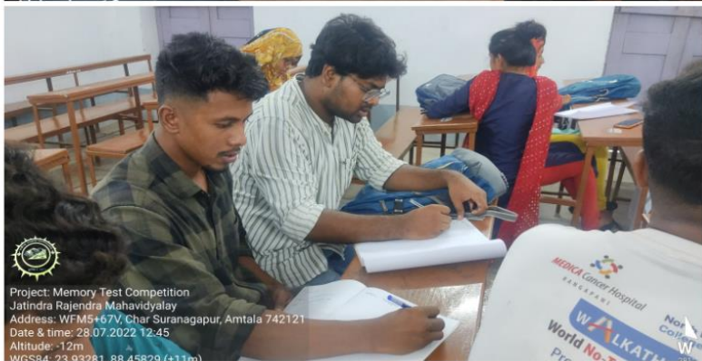
Project: Memory Test Competition Jatindra Rajendra Mahavidyalaya Address: WFM5+67V, Char Suranagapur, Amtala 742121 Date & time: 28.07.2022 12:45 Altitude: -12m GPS: 23.93281, 88.45829 (±11m)