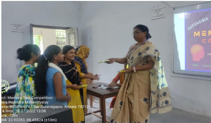
Project: Memory Test Competition Jatindra Rajendra Mahavidyalaya Address: WFM5+67V, Char Suranagapur, Amtala 742121 Date & time: 28.07.2022 13:08 Altitude: -12m GPS: 23.93283, 88.45824 (±10m)