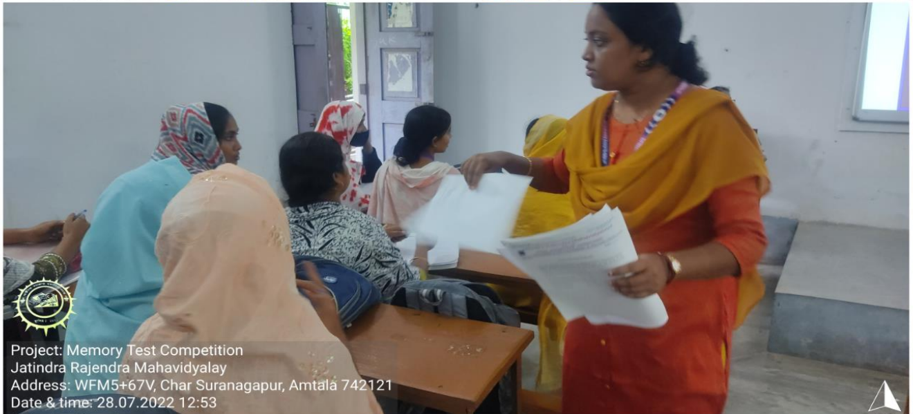
Project: Memory Test Competition Jatindra Rajendra Mahavidyalaya Address: WFM5+67V, Char Suranagapur, Amtala 742121 Date & time: 28.07.2022 12:53