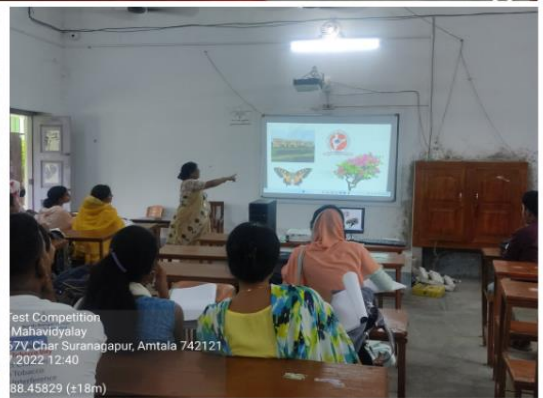
Project: Memory Test Competition Jatindra Rajendra Mahavidyalaya Address: WFM5+67V, Char Suranagapur, Amtala 742121 Date & time: 28.07.2022 12:40 Altitude: -12m GPS: 23.93283, 88.45829 (±18m)