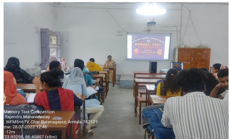
Project: Memory Test Competition Jatindra Rajendra Mahavidyalaya Address: WFM5+67V, Char Suranagapur, Amtala 742121 Date & time: 28.07.2022 12:46 Altitude: -12m GPS: 23.93298, 88.45807 (±8m)