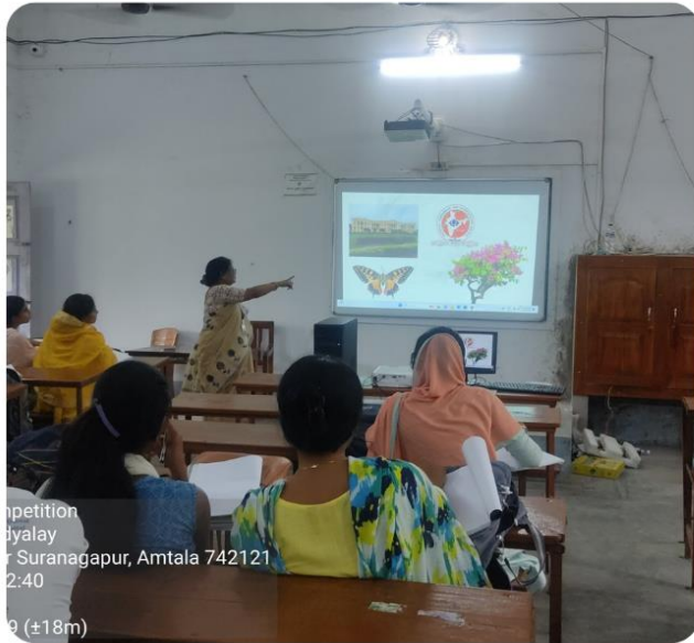
Project: Memory Test Competition Jatindra Rajendra Mahavidyalay Address: WFM5+67V, Char Suranagapur, Amtala 742121 Date & time: 28.07.2022 12:40 Altitude: 12m (±18m)