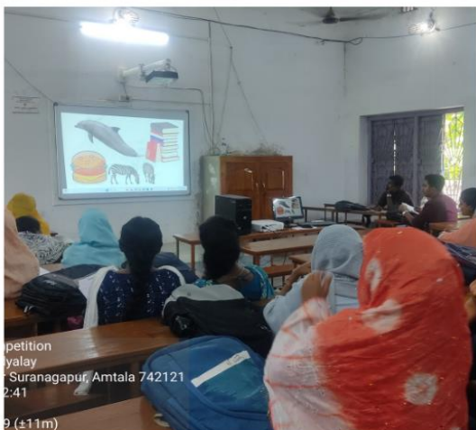
Project: Memory Test Competition Jatindra Rajendra Mahavidyalaya Address: WFM5+67V, Char Suranagapur, Amtala 742121 Date & time: 28.07.2022 12:41 Altitude: -12m GPS: 23.93283, 88.45829 (±11m)