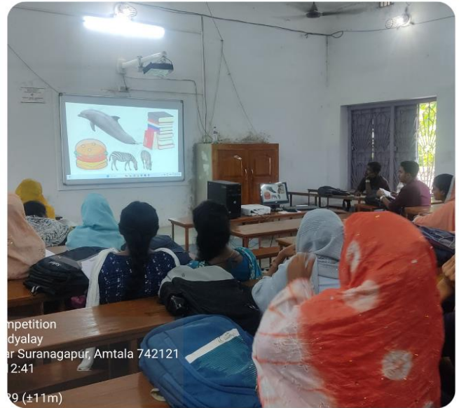
Project: Memory Test Competition Jatindra Rajendra Mahavidyalay Address: WFM5+67V, Char Suranagapur, Amtala 742121 Date & time: 28.07.2022 12:41 Altitude: 12m (±11m)